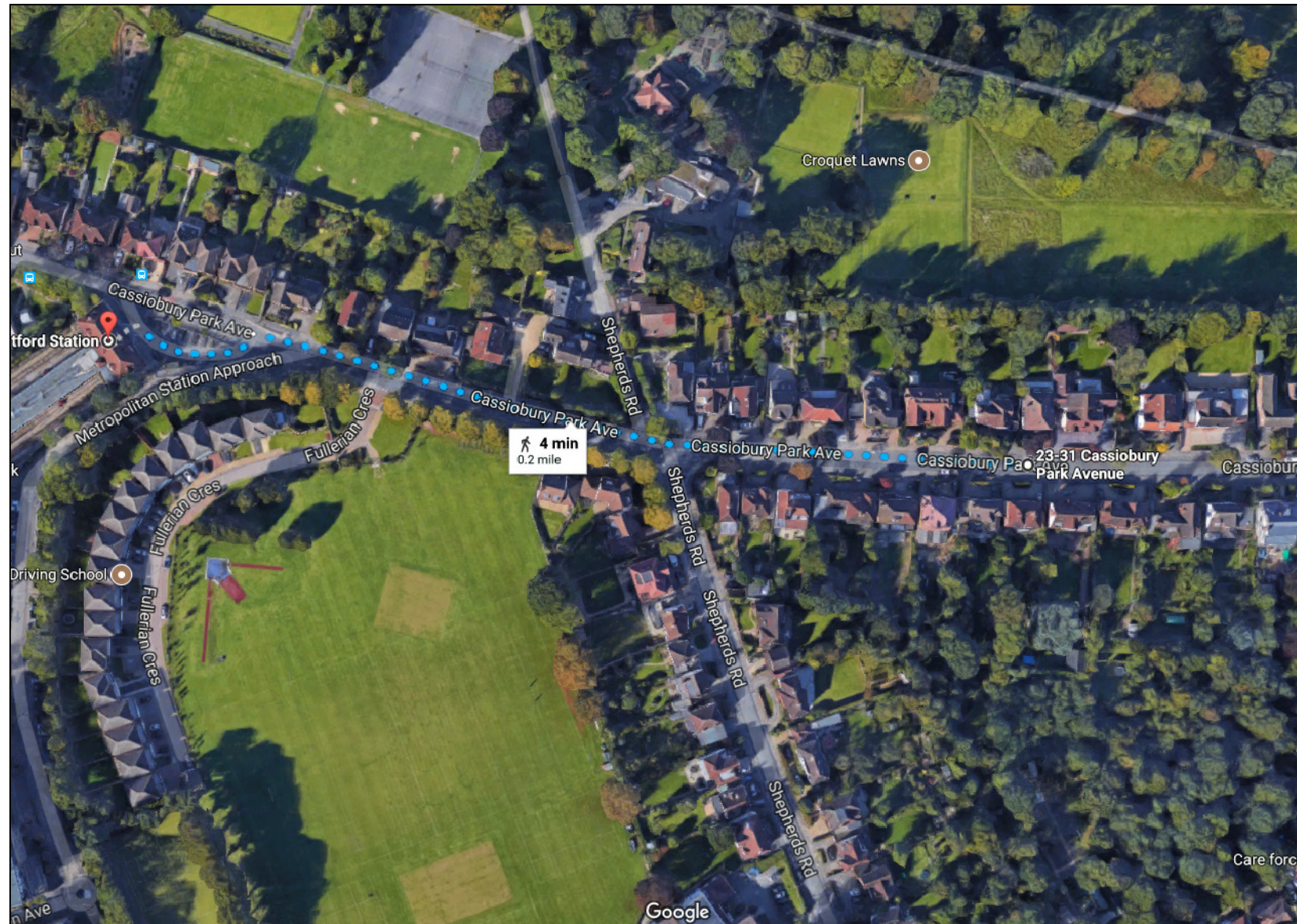
Approximate walking travel time and distance to Watford Station (Metropolitan Line) (Not to scale)